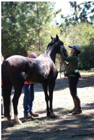
At the Foresthill Vet Check

"You could not make any time going down or coming up. We trotted only in three short sections that were a little flatter. As we were going down we passed a lot of people going up that were off their horses and walking."