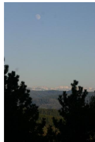
The Tevis Moon

The moon was high and bright overhead. They were entirely alone on the trail.