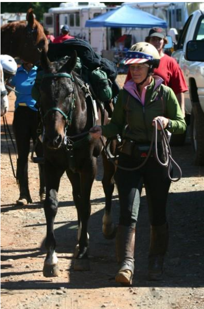
Heading out from Mosquito Ridge after the first hold

going to be traveling in company. A lot of it.