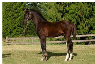
Sazanda- Salam x Anastasia

You can follow our exploits on my webpage blog at www.cgakhaltekkes.com