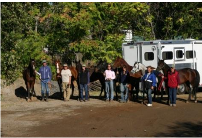
The Kenlyn Gang