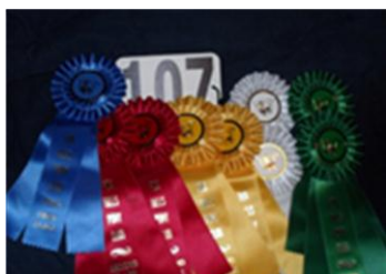
Ribbons from Maizie's first Show