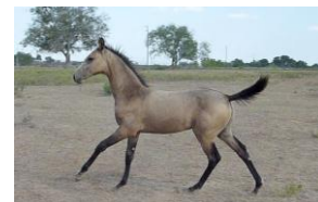
Charisma- Arim x Chrysantema