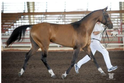
Eramay and handler at the Sporthorse Stallion Showcase