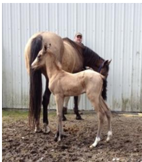
Merdan- Metman x Aishet

Snohomish, WA We've had our first foal of the year, a lovely buckskin colt by the late stallion Metman out of the Elite mare Aishet. While we were hoping for the elusive buckskin filly, Merdan is very nice and will do his parents proud. We have one more foal coming this year in June, Salam x Astra.