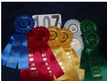
Catrina Mettam and her mare Mazaly cleaned up at their first show